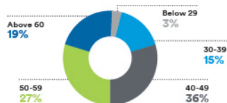
Prevalence of breast cancer among age groups in Nepal